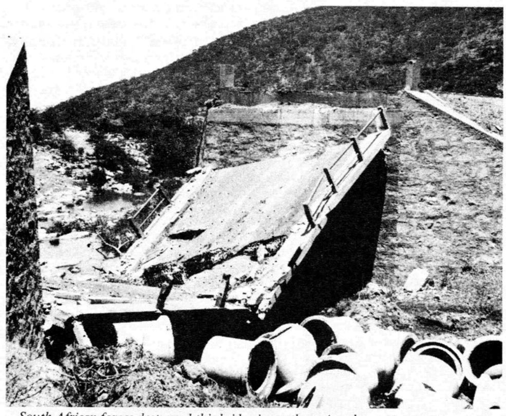
South African forces destroyed this bridge in southern Angola

has never traded with as many countries before as it does now. It has also never had as much overseas investment as it has today. This is a major paradox of our time. We have to ask ourselves: why is it that after such a long period of appeals from the South African people and the international community for sanctions against South Africa, the western powers, and Britain in particular, stand so strongly against it?