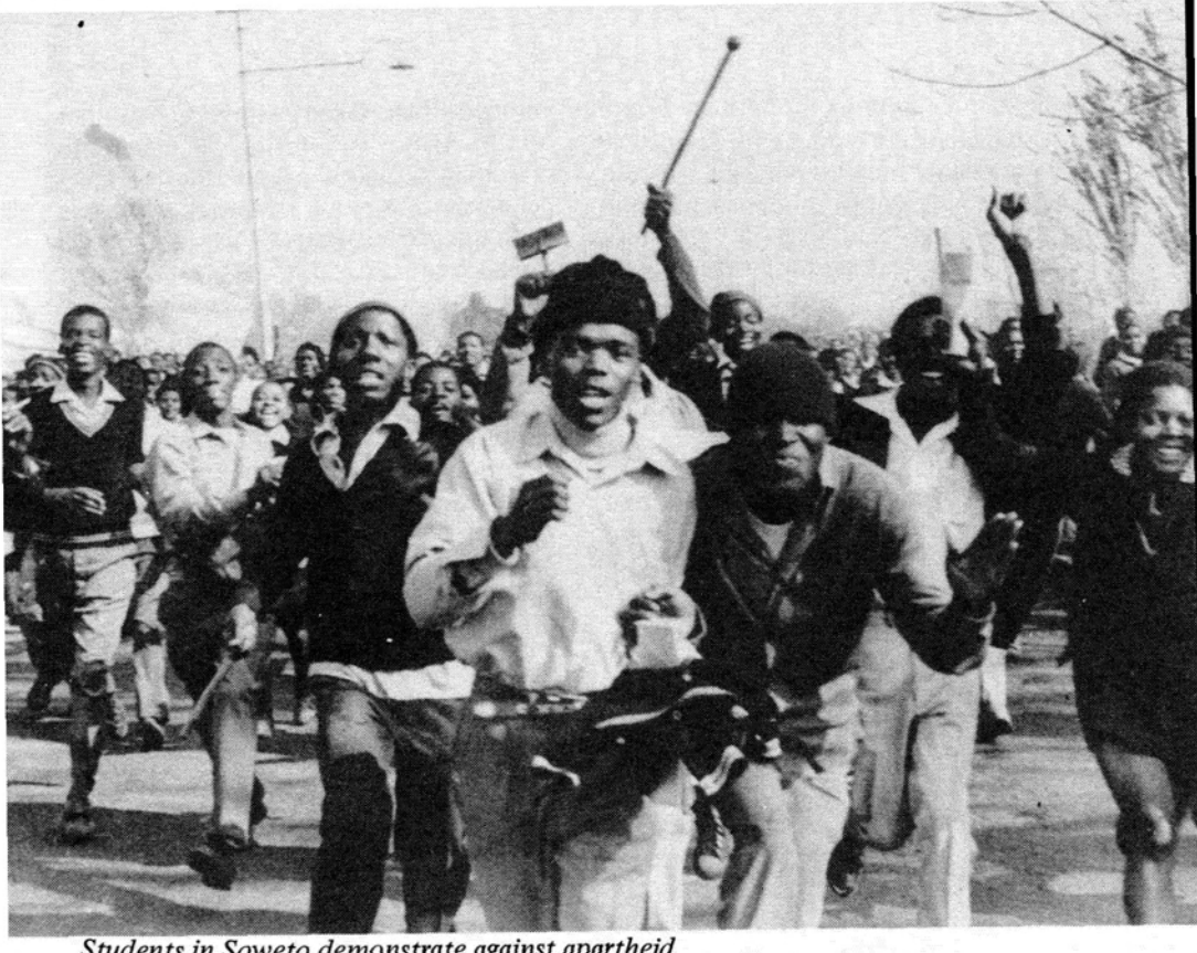
Students in Soweto demonstrate against apartheid

But today, in South Africa itself, there is a developing armed struggle and the majority people of that country are engaging in a courageous resistance which is nationwide and which we see symbolised by the action of trade unionists as well as students and other sections of the oppressed community. That resistance is increasing daily and the regime, which is getting desperate as a result of this resistance, is beginning to rely more and more on the exclusive use of force in order to keep itself in power.