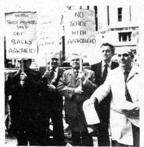
British trade unionists picket outside the CBI to demand an end to UK support for apartheid

Africa is an essential part of the process of national liberation. That is the key to the approach of the TUC and other national trade union organisations. For many years we have been giving -- and intend to go on giving - not only moral support but practical assistance to trade unions in South Africa which represent black African working people. The decision our Congress reached - at a time when you, Mr Chairman, presided over our International Committee has been shown to be correct and our policy of providing practical trade union assistance in South Africa has been fully vindicated. Black workers in South Africa have been forming and joining trade unions in increasing numbers ever since the Natal textile strikes in 1973, and the independent black trade union movement is now reliably estimated as being 300,000 strong. The process is still going on and it is irreversible.