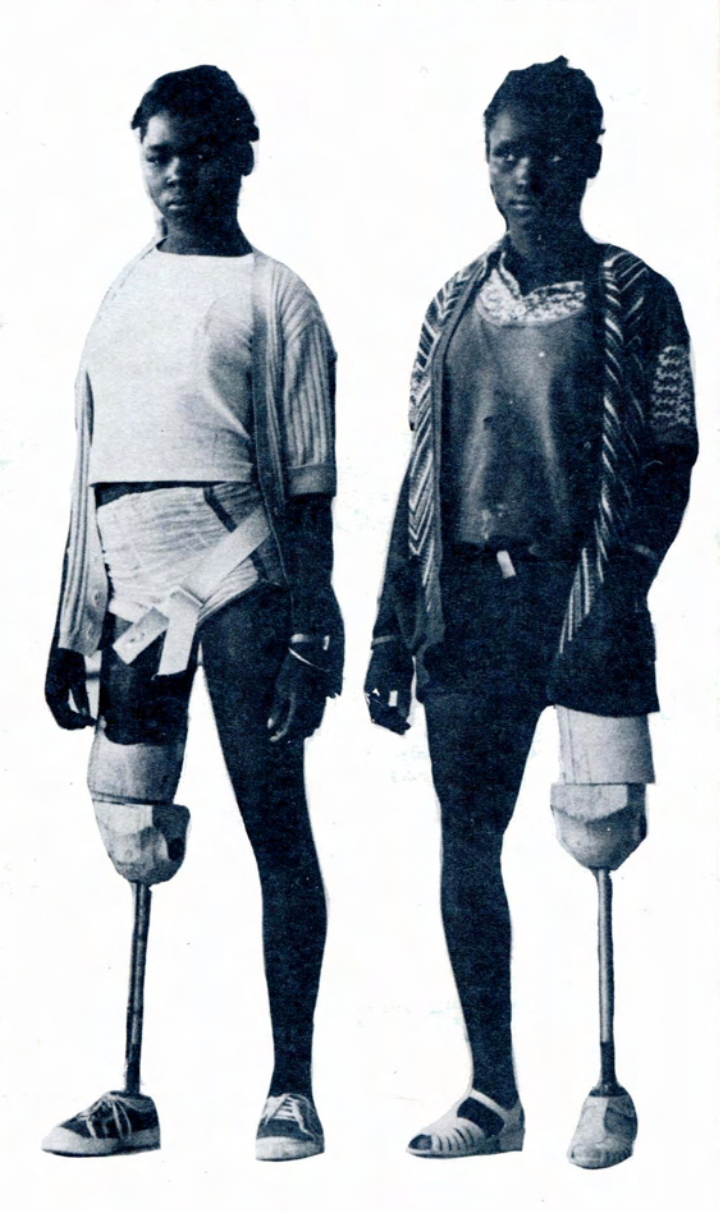
AGAINST APARTHEID AGGRESSION