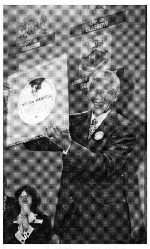
Nelson Mandela at the joint Freedom of The Cities ceremony, Glasgow, October 1993.

"The new non-racial South Africa must also become a beacon of hope for all those resisting racism wherever it raises its ugly head"