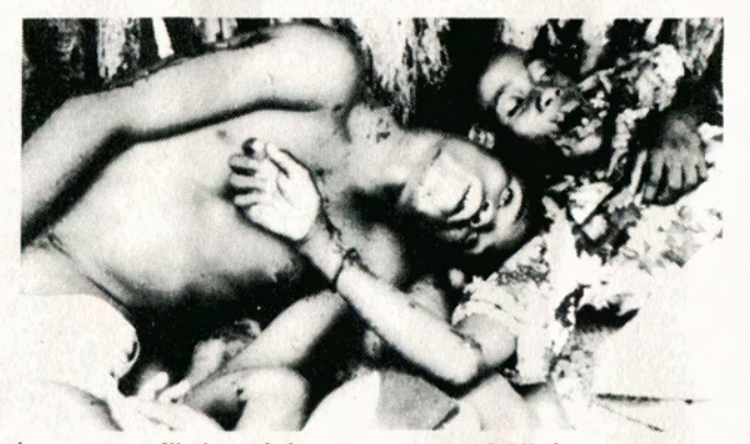
Victims of the massacre near Oshikuku. Killed by S.A. soldiers, March 1982.

As the war escalates, with Britain backing the South African occupation, our support for SWAPO must increase. Casualties have grown and the Namibian refugees (now numbering over 70,000) have multiplied; the need for medical supplies has now become desperate.