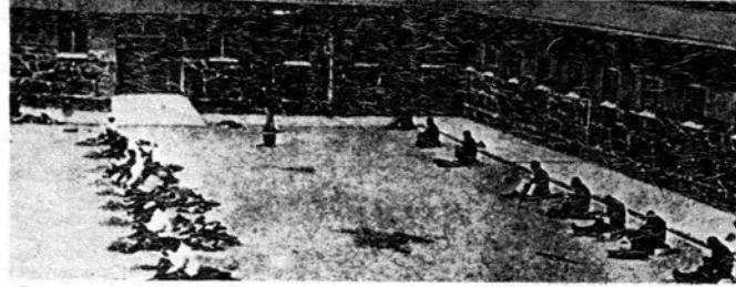
Courtyard, Robben Island

Anyone involved in opposition to the apartheid system is liable to be detained: for giving out anti-apartheid leaflets; for speaking at a meeting; for being involved in an independent trade union; for speaking out against forced evictions and deportations.