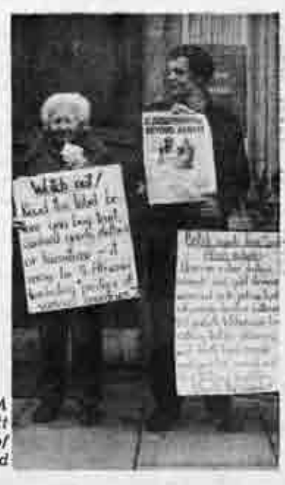
Camden AA boycott products of apartheid