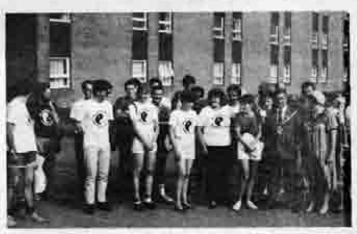
Teesside AA Soweto Walkers