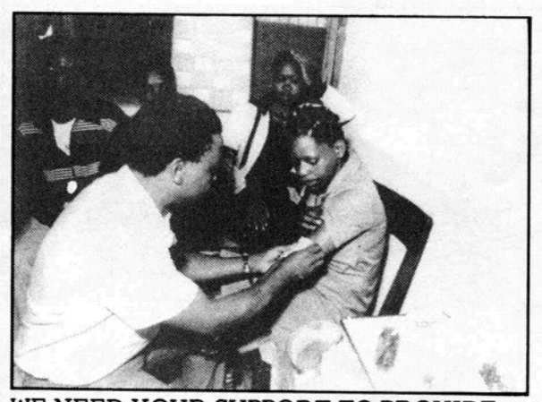
WE NEED YOUR SUPPORT TO PROVIDE: